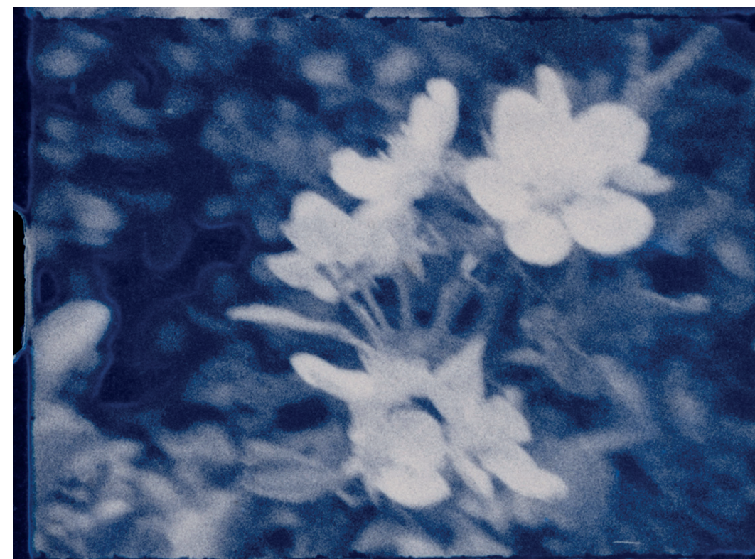
Helena Gouveia Monteiro, Purkyně's Dusk , film stills (imagens do filme)